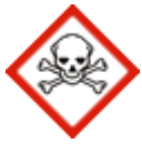
Skull and crossbones